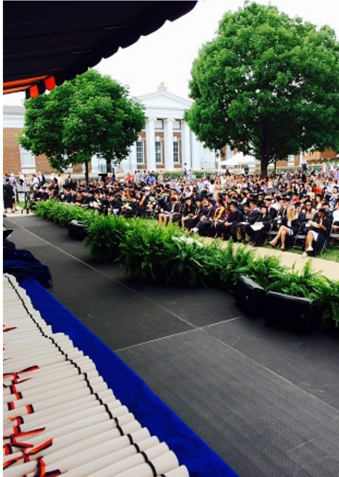
The Economics Department's diploma ceremony was held on Saturday, May 16, in front of Cabell Hall.