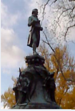
A statue of Thomas Jefferson stands ready to greet you at his famous Rotunda . The Rotunda is currently closed to the public for a two-year renovation.