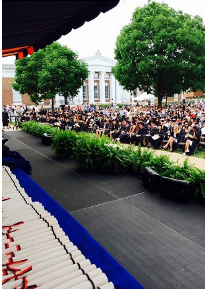
The Economics Department's diploma ceremony was held on Saturday, May 16, in front of Cabell Hall.