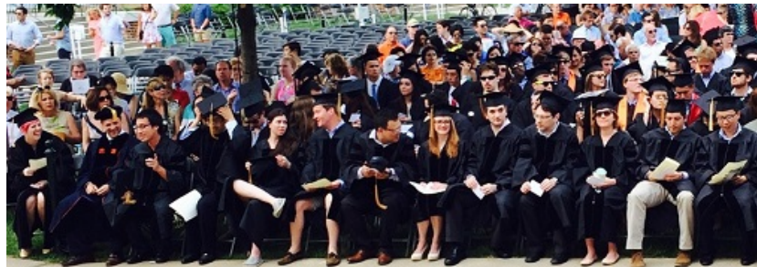
Our Ph.D. recipients await the start of the ceremony.