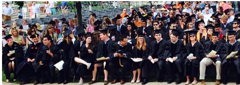
Our Ph.D. recipients await the start of the ceremony.