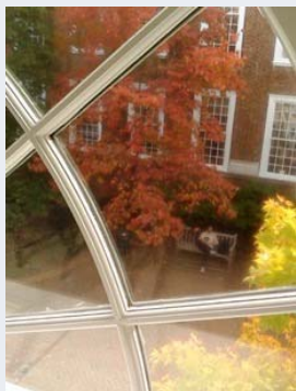
A view of the Monroe courtyard from our 2 nd -floor conference room.